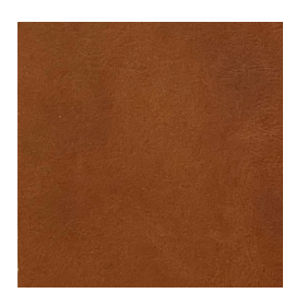
Tan Saddle Leather