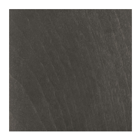
Beech Wood Dyed Smokey Grey - Matt