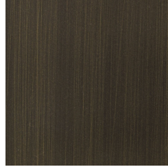
Metal Brushed Dark Bronze