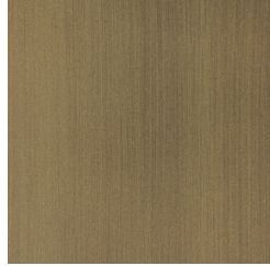
Metal Brushed Bronze