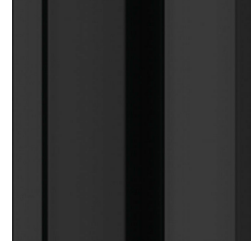
Metal Black Chrome - Glossy